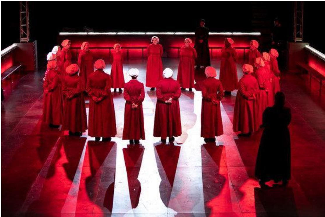
Boston Lyric Opera is staging Poul Ruders’s 2000 adaptation of “The Handmaid’s Tale” at the Lavietes Pavilion at Harvard University, which suggested the setting for much of Margaret Atwood’s novel.

When Margaret Atwood began her novel “The Handmaid’s Tale” with the line “We slept in what once been the gymnasium,” she may well have been referring to the Lavietes Pavilion here. After all, the dystopian story abounds with references to Boston and neighboring Cambridge, and suggests a Harvard University — Lavietes, its basketball arena, included — repurposed for the militaristic theocracy of Gilead.