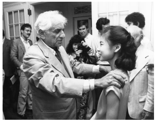
Midori, seen backstage at Tanglewood in Massachusetts with Leonard Bernstein.

— under the composer's baton no less. See what I mean? I just mentioned it. (And I'm happy to meet wherever is convenient for you to claim my violin, once you get it from Midori.)