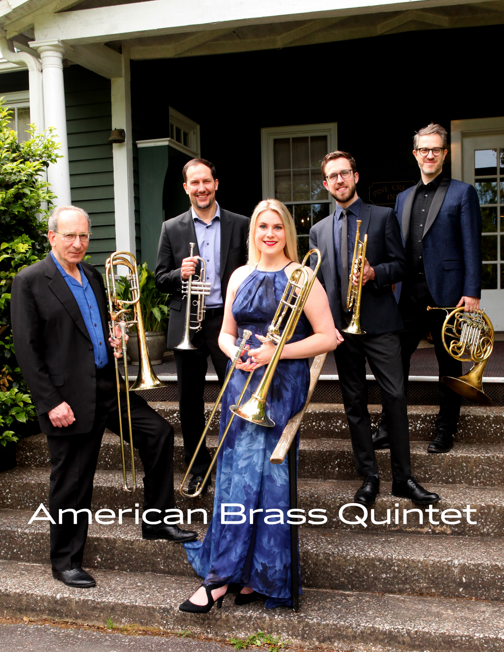
American Brass Quintet