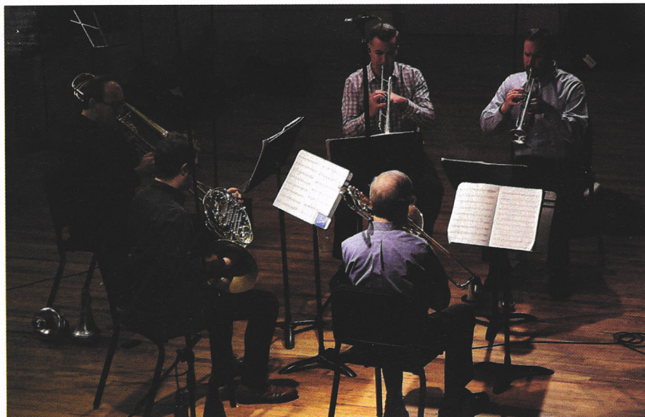
'A jubilant display of brass splendour': the American Brass Quintet shine in their new album, 'Perspectives'