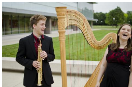
Admiral Launch Duo