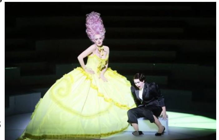
Kristine Opolais, left, as Vitellia and Tara Erraught as Sesto in "La Clemenza di Tito" conducted by Maestro Kirill Petrenko.