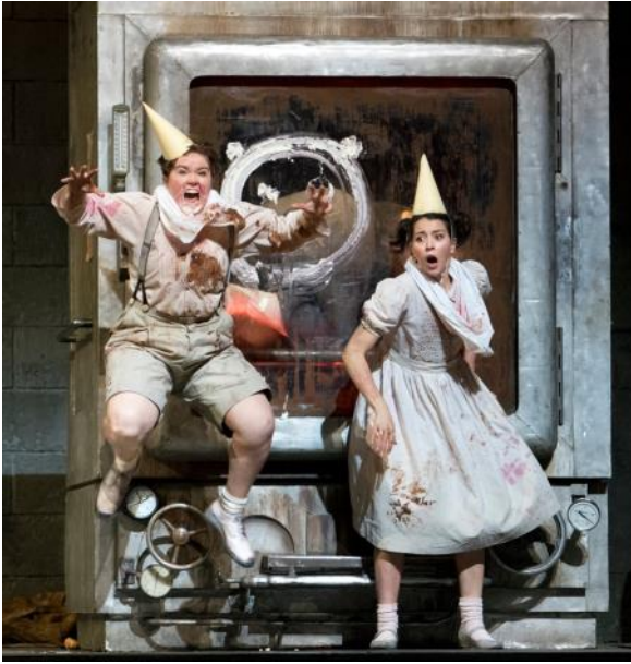
Tara Erraught, left, as Hansel and Lisette Oropesa as Gretel in "Hansel and Gretel" at the Metropolitan Opera.