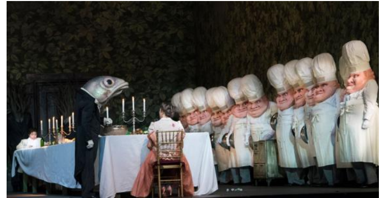
"Hansel and Gretel dream up 14 strange chefs with enormous puppet heads, who walk in and set the table for a lavish dinner."